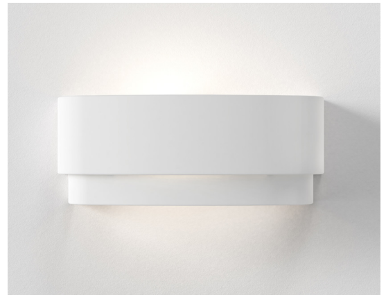
CODE: 1432001 FINISH: CERAMIC

TO MAINTAIN THIS PRODUCT TO ITS BEST CONDITION, PLEASE VIEW OUR CARE AND CLEANING GUIDE ON THE SUPPORT SECTION OF THE ASTRO WEBSITE.