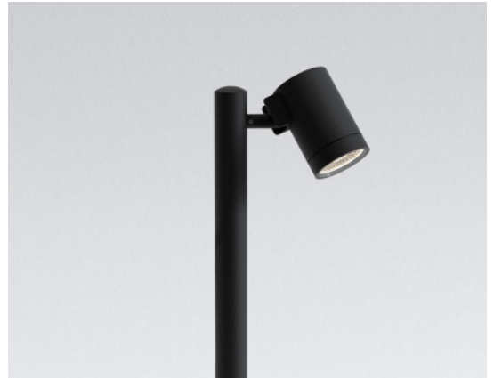
CODE: 1401012 FINISH: TEXTURED BLACK

THIS PRODUCT IS SUITABLE FOR ONEROUS ENVIRONMENTS AND CAN BE INSTALLED WITHIN FIVE MILES OF THE COAST - THREE YEAR WARRANTY APPLIES.