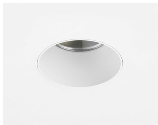
CODE: 1392006 FINISH: MATT WHITE

TO MAINTAIN THIS PRODUCT TO ITS BEST CONDITION, PLEASE VIEW OUR CARE AND CLEANING GUIDE ON THE SUPPORT SECTION OF THE ASTRO WEBSITE.