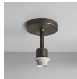
CODE: 1362009 FINISH: BRONZE

TO MAINTAIN THIS PRODUCT TO ITS BEST CONDITION, PLEASE VIEW OUR CARE AND CLEANING GUIDE ON THE SUPPORT SECTION OF THE ASTRO WEBSITE.