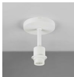
CODE: 1362004 FINISH: TEXTURED WHITE