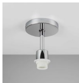
CODE: 1362001 FINISH: POLISHED CHROME