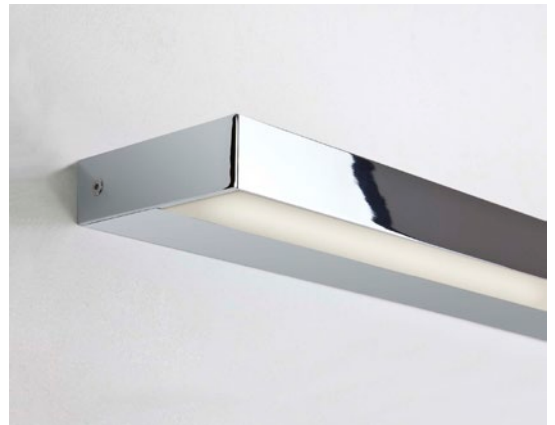
CODE: 1307009 (8180) FINISH: POLISHED CHROME

TO MAINTAIN THIS PRODUCT TO ITS BEST CONDITION, PLEASE VIEW OUR CARE AND CLEANING GUIDE ON THE SUPPORT SECTION OF THE ASTRO WEBSITE.