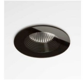
CODE: 1254016 FINISH: BLACK

TO MAINTAIN THIS PRODUCT TO ITS BEST CONDITION, PLEASE VIEW OUR CARE AND CLEANING GUIDE ON THE SUPPORT SECTION OF THE ASTRO WEBSITE.