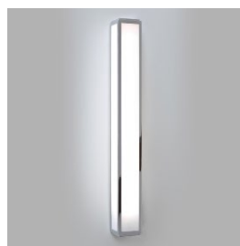
CODE: 1121020 (7134) FINISH: POLISHED CHROME