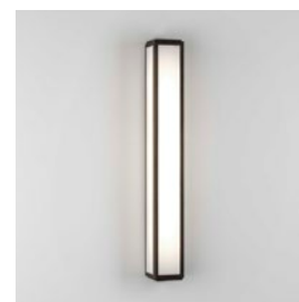
CODE: 1121058 (8291) FINISH: BRONZE

THIS PRODUCT IS SUITABLE FOR ONEROUS ENVIRONMENTS AND CAN BE INSTALLED WITHIN FIVE MILES OF THE COAST - THREE YEAR WARRANTY APPLIES.